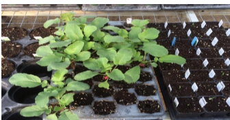
Plants started by our participants.